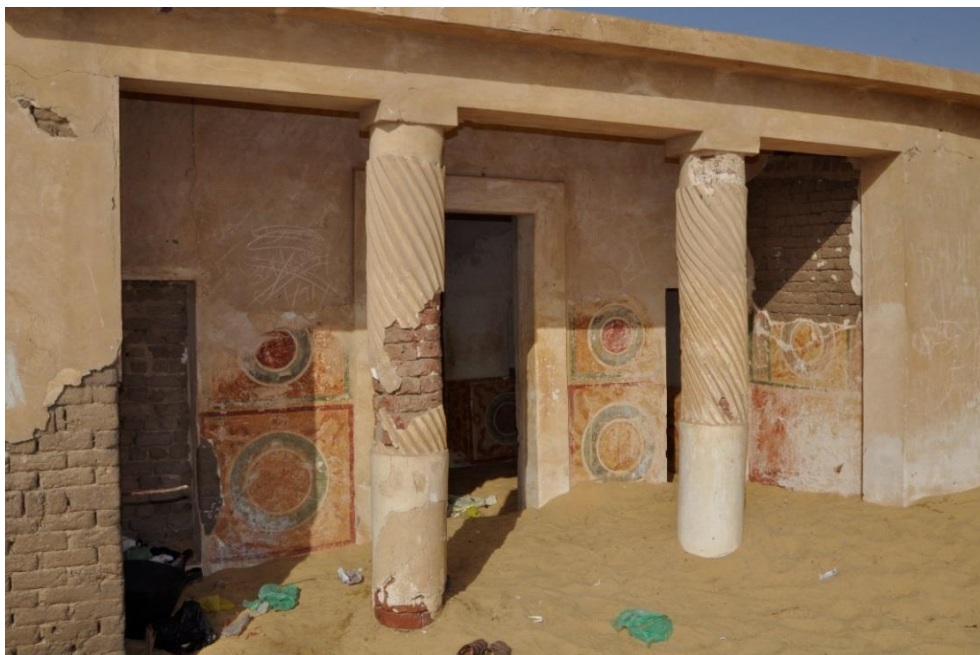
Status: October 2018

The wall paintings are exposed to the elements and human action. In this respect, it is desirable to establish a maintenance and monitoring programme for the future.