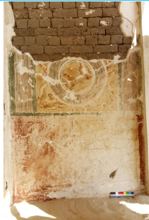
Condition after treatment

The most vulnerable areas of the artwork could be stabilized. Further treatment is essential to guarantee long-term conservation.